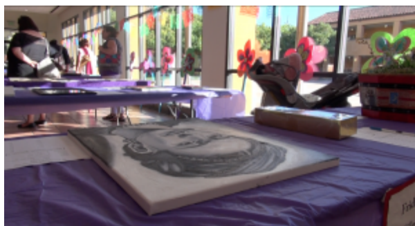
Silent art auction item at the 8th Annual Frida Kahlo Fundraiser, which took place on Friday, July 12, 2013 at the Mexican Heritage Plaza.