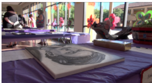
Silent art auction item at the 8th Annual Frida Kahlo Fundraiser, which took place on Friday, July 12, 2013 at the Mexican Heritage Plaza.