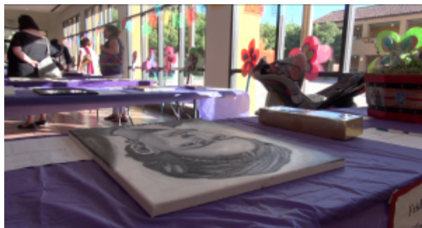
Silent art auction item at the 8th Annual Frida Kahlo Fundraiser, which took place on Friday, July 12, 2013 at the Mexican Heritage Plaza.