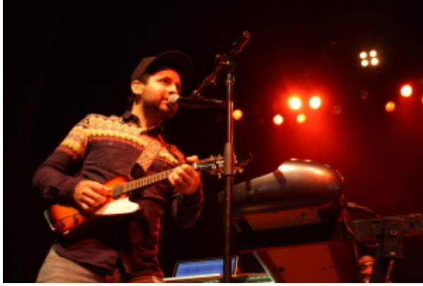
Eduardo Cabra, mejor conocido como Visitante, músico y productor de Calle 13 haciendo coros y tocando en the Warfield de San Francisco, Calif., el viernes, 10 de octubre del 2014.

Entre el romanticismo y amor de “Beso de Desayuno” y “Ojos Color Sol,” Residente nos recuerda que “No podemos morir haciendo lo que no nos gusta,” y nos invita a darle “La Vuelta al Mundo.”