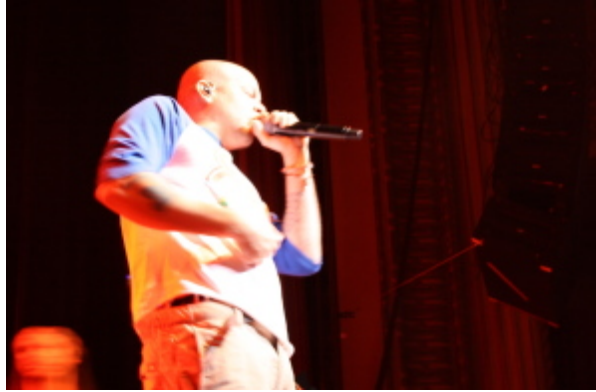
René Pérez Joglar, mejor conocido como Residente, vocalista de Calle 13 cantando en the Warfield de San Francisco, Calif., el viernes, 10 de octubre del 2014.

¡Momentos después de conversar con los jóvenes estalla la bomba que es Calle 13! En esta gira es imposible no contagiarse de la “Fiesta de Locos” y si “aquí se baila como bailan los pobres,” ¡que rico! Como el buen amante de su público que es, Residente explico la razón de la demora y se disculpo antes de brindar por “El Aguante.”