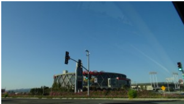
Oakland, Calif.- The Oracle Arena and O.co Coliseum are home to the A’s, the Raiders and the Warriors. This summer the arena will host celebrities such as The Rolling Stones, One Direction and P!nk in concert.