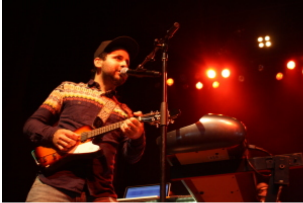
Eduardo Cabra, mejor conocido como Visitante, músico y productor de Calle 13 haciendo coros y tocando en the Warfield de San Francisco, Calif., el viernes, 10 de octubre del 2014.

Entre el romanticismo y amor de “Beso de Desayuno” y “Ojos Color Sol,” Residente nos recuerda que “No podemos morir haciendo lo que no nos gusta,” y nos invita a darle “La Vuelta al Mundo.”