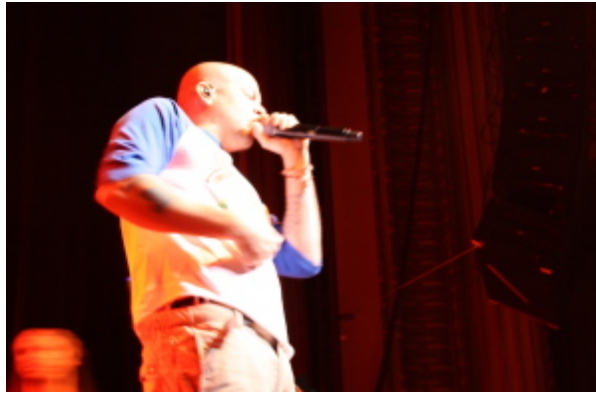
René Pérez Joglar, mejor conocido como Residente, vocalista de Calle 13 cantando en the Warfield de San Francisco, Calif., el viernes, 10 de octubre del 2014.

¡Momentos después de conversar con los jóvenes estalla la bomba que es Calle 13! En esta gira es imposible no contagiarse de la “Fiesta de Locos” y si “aquí se baila como bailan los pobres,” ¡que rico! Como el buen amante de su público que es, Residente explico la razón de la demora y se disculpo antes de brindar por “El Aguante.”