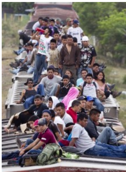
Migrants ride on top of a northern bound train toward the US-Mexico border in