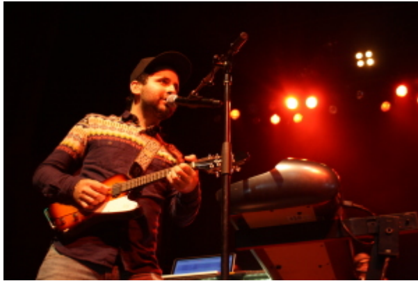
Eduardo Cabra, mejor conocido como Visitante, músico y productor de Calle 13 haciendo coros y tocando en the Warfield de San Francisco, Calif., el viernes, 10 de octubre del 2014.

Entre el romanticismo y amor de “Beso de Desayuno” y “Ojos Color Sol,” Residente nos recuerda que “No podemos morir haciendo lo que no nos gusta,” y nos invita a darle “La Vuelta al Mundo.”